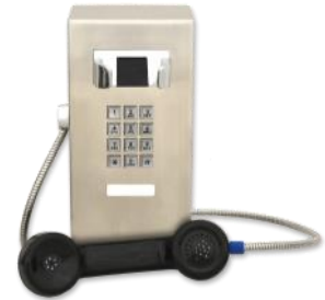
SSW-323-F-M (SPD 2.01)

Microprocessor based coinless telephone equipped with CAC 6.00 FIRMWARE is designed to withstand abuse and fraudulent call attempts while implementing call control. Microphone is muted to guard against fraud as well as select options for tone (DTMF) or pulse dialing. Call restriction features include: allowing or blocking incoming calls, speed dialing up to 40 pre-programmed numbers, automatically dialing one or two numbers when the handset is lifted (PBX or access number), and call blocking, for example, long distance calling and/or limiting call time duration.