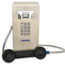
SSW-323-F-IVC (CAC 6.00)

Microprocessor based telephone equipped with ADT 1.03 FIRMWARE . Keypad with two rows of six buttons, each programmed to dial a single number up to 23 digits in length. Label has an area provided to list call destinations next to relevant buttons. The transmitter stays muted (off) during periods of dial tone to deter the use of hand held dialers and hookswitch dialing. Attempts to make fraudulent calls are detected and blocked, causing the microprocessor to reset. Incoming calls may be allowed or blocked.