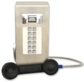
SSW-323-E (ADT 1.03)

PRODUCT MANUALS WITH FULL FEATURES AND FUNCTIONS AVAILABLE UPON REQUEST