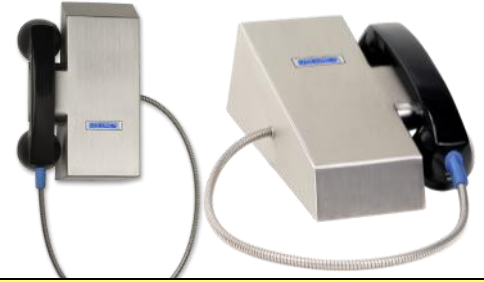
MHW-341-X-IVC or MHD-341-X-IVC

The MHD(W)-341-F is built with a sturdy marine quality chrome keypad that can either be a desk top (MHD shown above right) or wall phone (MHW shown above left). This sturdy and attractive telephone is sealed with rugged vandal resistant stainless steel and equipped internal magnetic hookswitch and magnetic handset, 32" armored cord handset, chrome tone keypad, internal volume control via volume control button with loudness symbol and background noise elimination and tamper resistant screws. These "built to last" phones are designed for areas that are subject to fraud and abuse as well as airborne corrosion and pollutants.