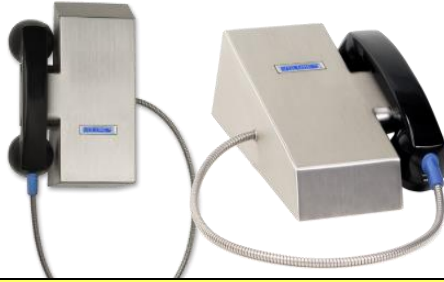
MHW-341-D-IVC or MHD-341-D-IVC