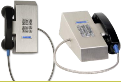
MHW-341-F-IVC or MHD-341-F-IVC

PRODUCT MANUALS WITH FULL FEATURES AND FUNCTIONS AVAILABLE UPON REQUEST