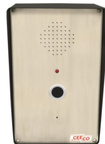
HOB-531-D, HOB-531-D2 HOB-531-X

The HOB-531-F speakerphone with keypad provides DTMF dialing and can be programmed for call restrictions and blocking, speed dial, conversation time-out, and PBX prefix dialing. The stainless steel design panel with puncture and weatherproof speaker, encased in a steel black painted open enclosure housing makes this speakerphone ideal for your toughest customers.