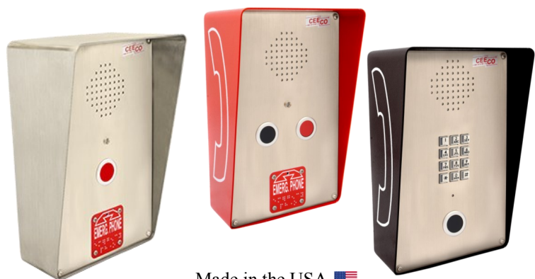
Made in the USA

CEEEO HOB-531 Series is an open enclosure, weather resistant, handsfree speakerphone that is designed for both indoor and outdoor areas offering limited protection from the elements. Our handsfree phones are available with keypad (-F), autodial (-D), and ring-down (-X) operation. The speakerphone operation is a press to start, press to stop call button for the initiation and termination of phone calls with an LED visual call process indication light. Handsfree operation eliminates out of service complaints and costly repairs due to missing handsets. Automatic disconnect circuits ensure that the telephone will not be left in the "off-hook" position. The speakerphone can allow/disallow incoming calls as well as timed calls if desired. The telephone housing is powder coated steel or stainless steel with a high grade stainless steel panel to eliminate rust and corrosion which provides an attractive finish. The internal circuitry provides exceptional audio balancing and overall sound quality, as well as over-voltage protection to help guard against surging that might be generated by various conditions including storms. Our HOB-531 Series are built to last!